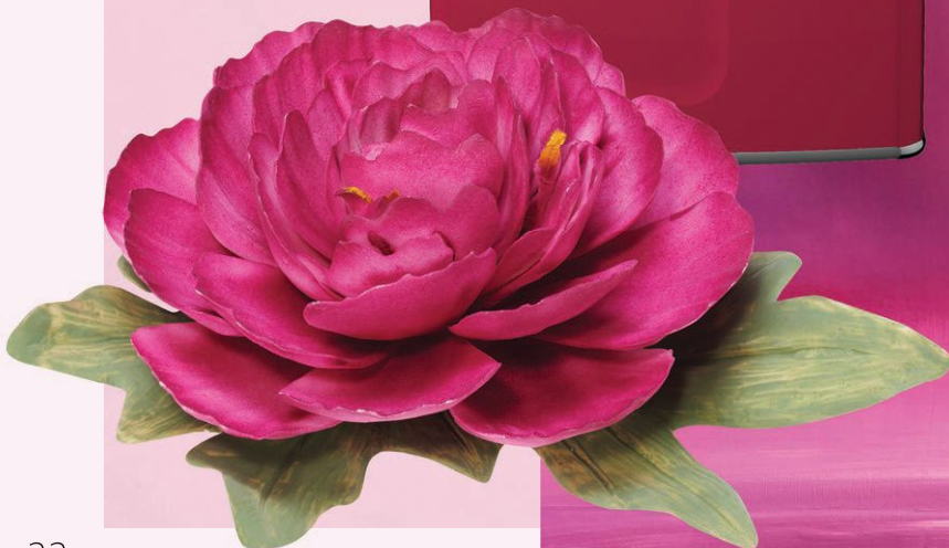
AERIN Bloom porcelain flower, aerin.com