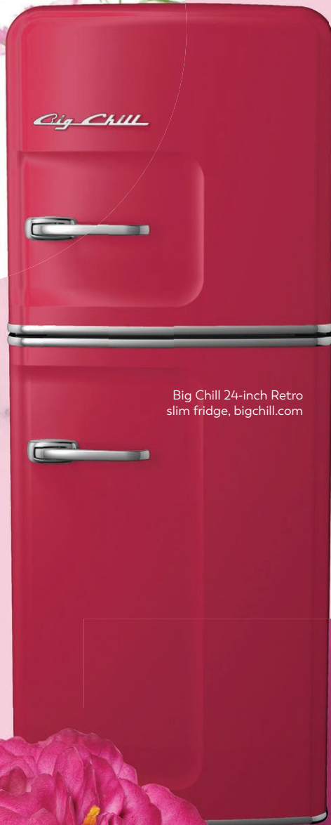
Big Chill 24-inch Retro slim fridge, bigchill.com