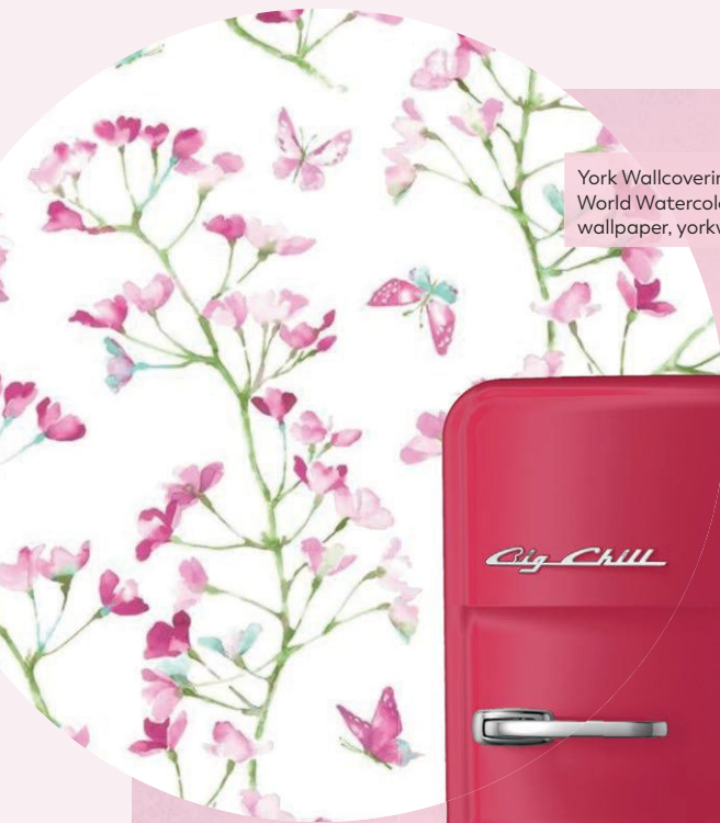
York Wallcoverings A Perfect World Watercolor Branch wallpaper, yorkwallcoverings.com