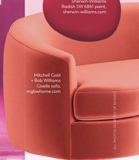
Mitchell Gold + Bob Williams Giselle sofa, mgbwhome.com