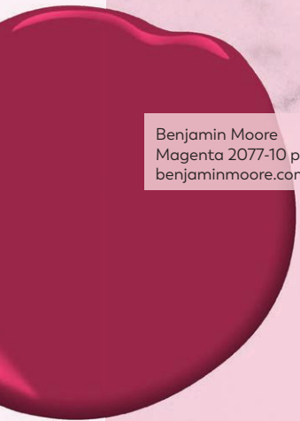
Benjamin Moore Magenta 2077-10 paint, benjaminmoore.com